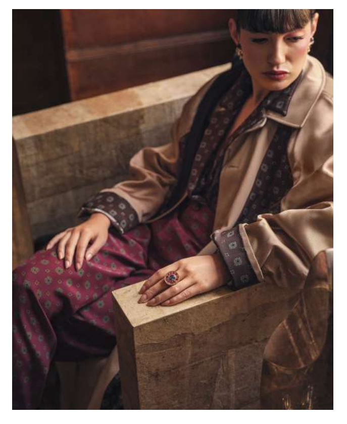
Beaux floor lamp, Arteriors. Peonia armchair, Wilkinson & Rivera for SCP. Hanover console table, Tom Faulkner. (On model) Blouse, trousers and trench coat, all Moschino. Earrings and ring, both Elizabeth Gage. Shoes, Malone Souliers>