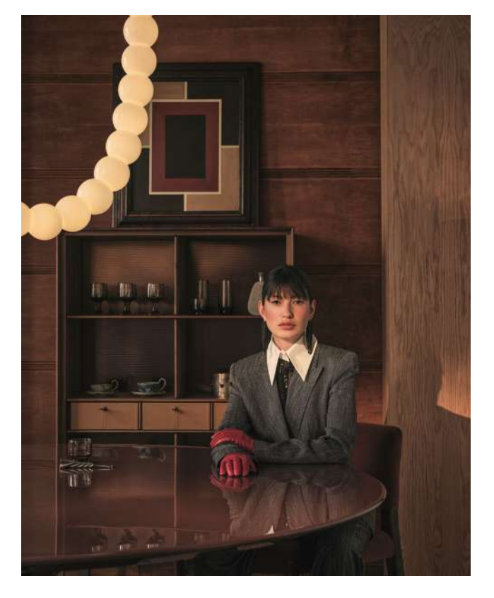
Halti chandelier , Cameron Design House. Carlo dining table , Boffi | De Padova. Matics cabinet , Porada. Golden Pheasant rug , Deirdre Dyson. Midseason II framed art by Studio Earle at M.A.H. Luccio chairs , Julian Chichester. All other accessories , The Table. (On model) Top , trousers , jacket and boots , all Alberta Ferretti. Earrings , A Sinner in Pearls. Gloves , Handsome Stockholm >